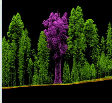
Figure 1. Fixed wing lidar and imagery data from the Sequoia National Forest images the 'General Sherman' tree and yields quantitative estimates of fuel loads in the canopy and on the forest floor.

In 2018 alone, California wildfires released 68 million tons of heat trapping carbon dioxide, or about 15 percent of all emissions produced by California on an annual basis. Scientists estimate that the CO2 production from a 100K acre fire is equivalent to the CO2 emissions of 7 million automobiles running continuously for one year! We cannot solve the climate crisis without first addressing the wildfire problem. Likewise, water quality in reservoirs and riparian environments are being negatively impacted by these extreme wildfires.