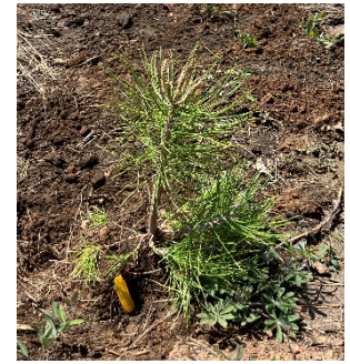
Figure 1. Reforestation need from recent fires in California.

University of California Agriculture and Natural Resources offers post-fire outreach & education.